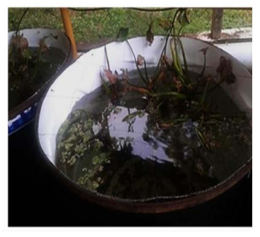
Figure 3: Aquatic plants after eight weeks of treatment with RO reject water

After eight weeks of RO reject water exposure, dry tissues of P. stratiotes showed 11x10^3 mgkg<sup>-1</sup> of maximum magnesium accumulation in treatment tanks filled with RO reject water compared to E. crassipes . The highest sodium accumulation ( 14x10^3 mgkg<sup>-1</sup>)