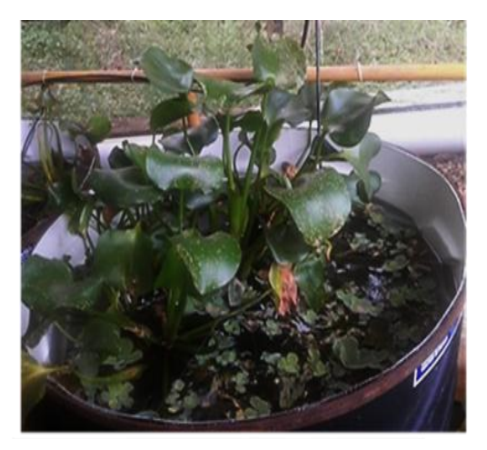
Figure 2: Aquatic plants after eight weeks of treatment in control

aquatic plants showed the Both capacity to accumulate ions in their biomass. The highest accumulation of ions per plant biomass was observed for calcium in aquatic plants treated with RO reject water. The amount of ion accumulation increases within plants with the concentration of dissolved ions in water used for treatment (Borker et al., 2013). They showed the capacity for higher accumulation of ions only for magnesium, sodium and potassium among tested parameters when treated with RO reject water compared to control.